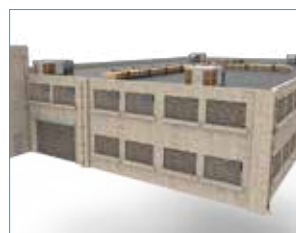
Factory / Warehouse