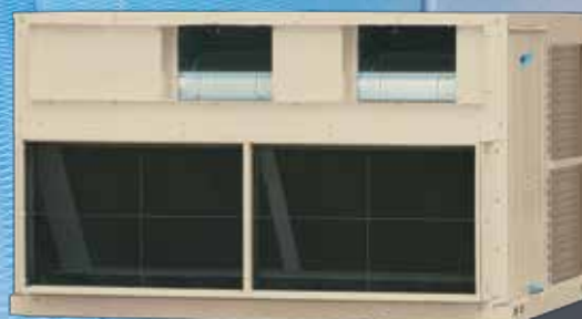
UATN120/150/ 210/240/ 300CGY1X